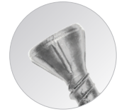
Trim Head with Nibs for easy countersinking