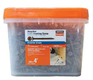
SDWS16400Q 102mm Qty 750