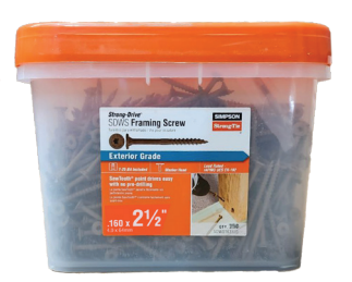
SDWS16212Q 64mm Qty 1,000