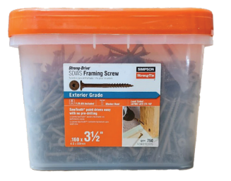
SDWS16312Q 89mm Qty 750