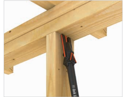
Wide-face stud to top plate.