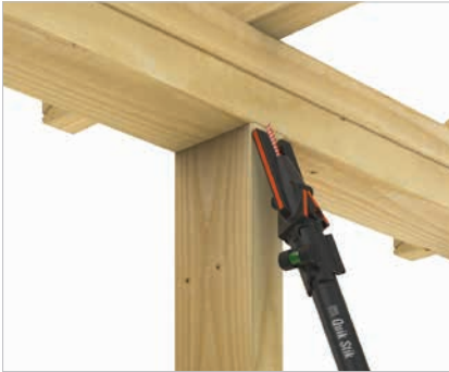
Narrow-face stud to top plate.