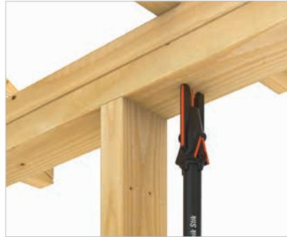
Truss rafter offset from stud.