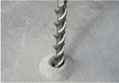
1. Pre-drill hole in concrete.