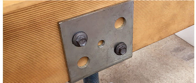
Note: When fixing 65mm - 100mm wide timber to MPS use 6.4mm x 76mm SDS Heavy Duty Connector Screws. Or when fixing 45mm - 65mm wide timber to MPS use 6.4mm x 38mm SDS Heavy Duty Connector Screws.