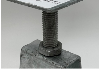
2. Set height accordingly.