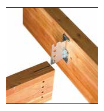
3. Attach joist and insert remaining pins. Pins should be centered in joist.