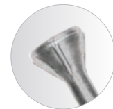
Trim head with nibs for easy countersinking